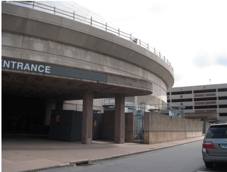
EXISTING COOLING TOWERS