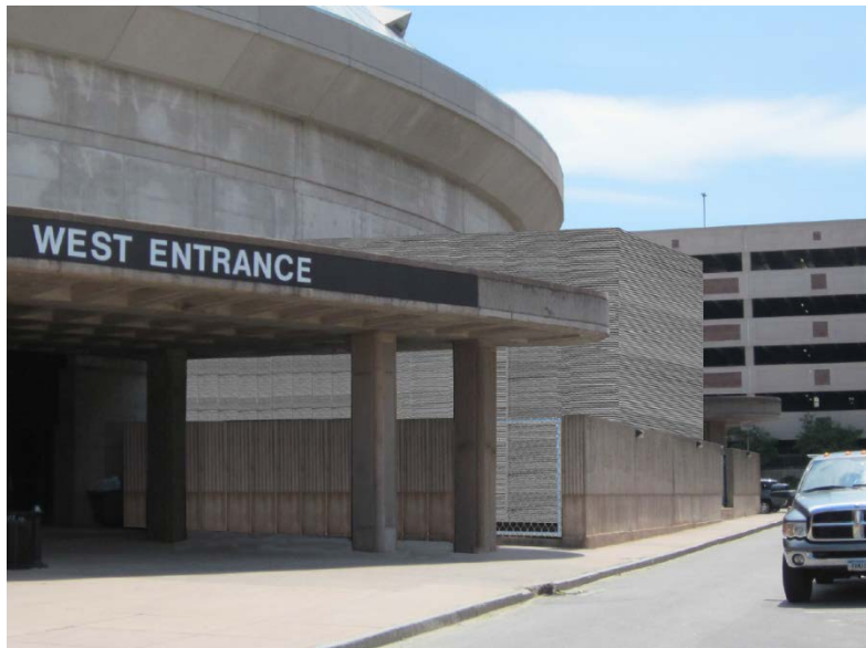
PROPOSED COOLING TOWER ARRANGEMENT