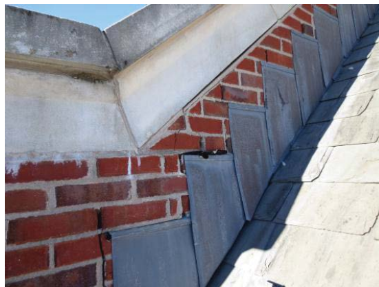
Photo 3 - Snow Hall - Mortar separation below frieze unit and cracked brick masonry