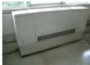
OLD MECHANICAL SYSTEMS