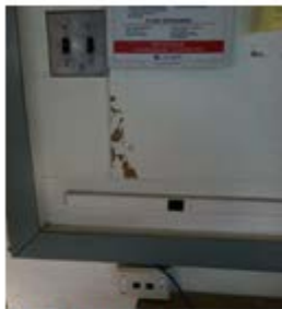
INADEQUATE ELECTRICAL SERVICE