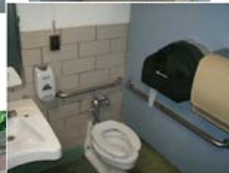
OUTDATED AND NON- COMPLIANT LAVATORIES