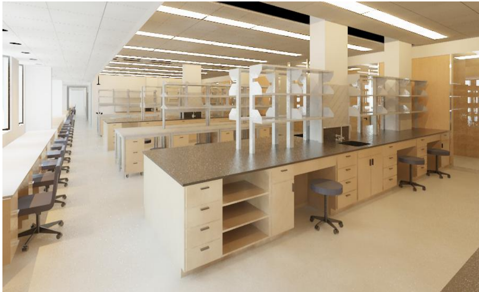
IMAGE OF PROPOSED RENOVATED LAB SPACE