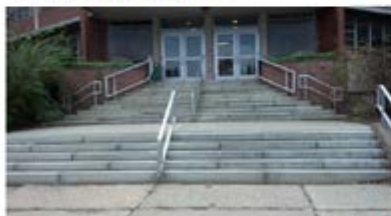
NEEDED EXTERIOR REPAIRS