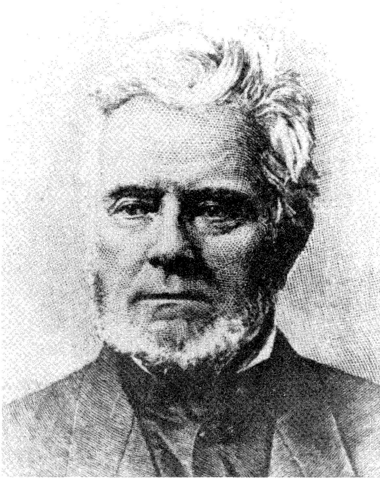
This portrait engraving of Lowell Mason was made on an unknown date by an unknown artist. The engraving is believed to have been published in New England Magazine.

Mason's reforms were not unlike Beecher's efforts to make New England theology more acceptable to the general population without surrendering to the cruder, and much more popular, revivalists of the frontier or to the more liberal Unitarians who dominated in Boston. 38 This new middle-of-the-road interpretation, known then as "Beecherism" or "New-Light theology," allowed Beecher to compete for converts on two fronts, with the revivalists on one hand and the Unitarians on the other. 39