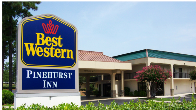
Best Western hotels emphasize the chain's brand more than the hotel's brand

aren't very specific. Hence, there is less authority granted to a hostel brand name. Voluntary chains are popular in the hostel industry, especially the omnipresent Hostelling International. However, these chains function quite differently than hotel chains. Hotel chains like Best Western put their chain brand first, such that guests might not even realize the hotel is independently owned. Meanwhile, hostels put their own brand first, such that guests might not even recognize that the hostel is a member of a voluntary chain. This is likely because accreditation, like that from Hostelling International, may simply mean that the hostel conforms to a certain set of minimum requirements. It is not a testament to the type of person the hostel is meant for and the kind of experience it offers its guests. Evidently, transaction costs are very different for hostel guests, which leads to more fragmented governance structures in the hostel industry than the hotel industry.