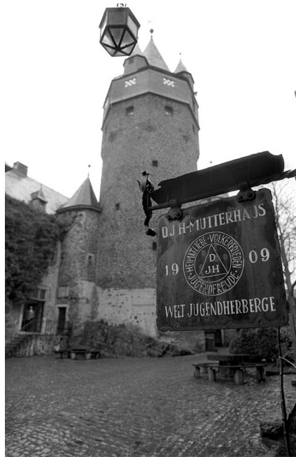
The original Jugendherberge at Altena Castle, where a hostel still exists

Given the relative newness of the hostel concept, there is little research surrounding the industry, especially in comparison with the mature body of research conducted on the hotel industry.