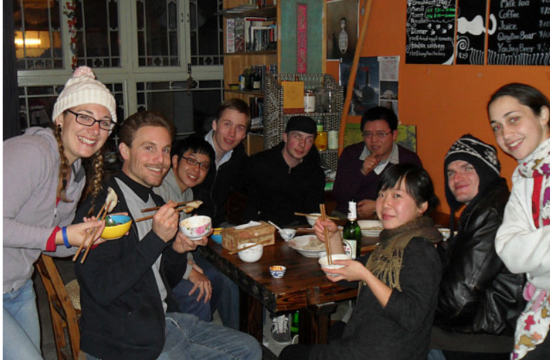
A group of backpackers share a meal in a Beijing hostel. Many hostels have communal kitchens that guests may use.

How and why do backpackers choose to stay at a hostel? The two main reasons why backpackers choose to stay in hostels instead of hotels are to save money and to meet other travelers, although the central reason backpackers choose to stay in hostels is cost (Murphy 55). Although hostel prices vary depending on their location, from $45 per night in Switzerland to $2.50 in Cambodia (prices found on Hostels.com in March 2014), they are almost always the cheapest form of accommodation in town. When choosing amongst hostels, the top five buying criteria for backpackers were cleanliness, location, personal service, security, and hostel services (Oliveira-Brochado & Gameiro 96). Besides price, many hostel guests also cite the opportunity to meet other travelers as a motivation to stay in youth hostels. Given the communal nature, hostels are much better than hotels at facilitating social interaction with new people. Oliveira-Brochado and Gameiro suggest, “Staying in a hostel is an experience rather than an accommodation” (98).