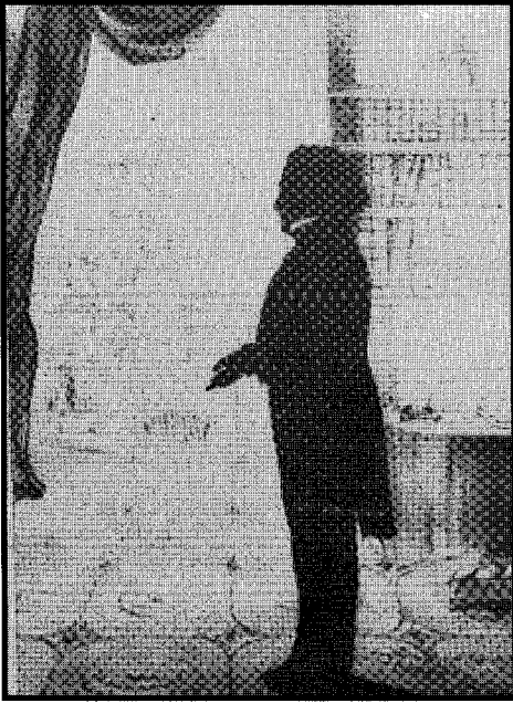
Joseph Story Litho- graph, 1844 William Henry Brown.