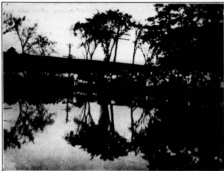
VICTORIOUS SOPHOMORES Rope Team That Easily Defeated Underclassmen

In the evening at eight o'clock, the sophomores held a dance in the Armory, to which all upperclassmen were invited. The college orchestra furnished the music.