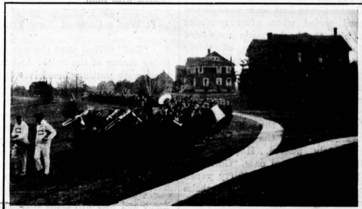
BEFORE THE R. I. GAME LAST YEAR

The year before last more than half the student body journeyed to Kingston in a special train to see R. I. go down in defeat to Connecticut. Last year a great crowd of Kingstonsians appeared to witness the tie battle on Dow Field.