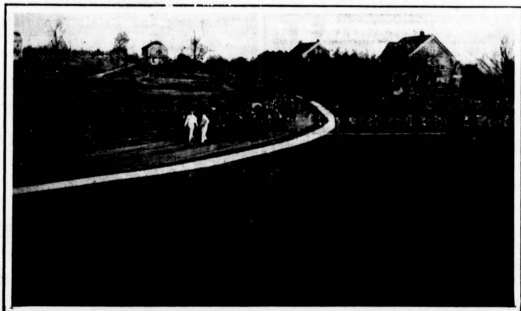
PARADING BEFORE THE GAME