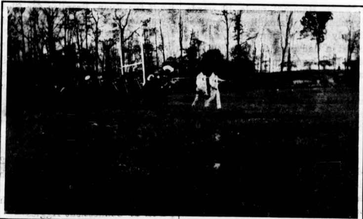
CHEER LEADERS LEADING BAND