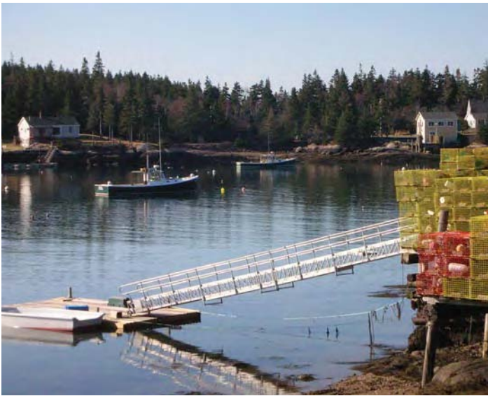
Plenty of lobster gear can be found in the waters of Stonington, Maine. Right whales can become entangled if they get too close.