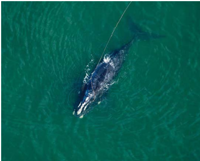
New England Aquarium

The New England Aquarium keeps a catalog of individual right whales with identifying characteristics and family relationships. They have been very involved in right whale research and conservation, and even have an Adopt a Right Whale program. (Editor's note: see http://www.neaq.org .)