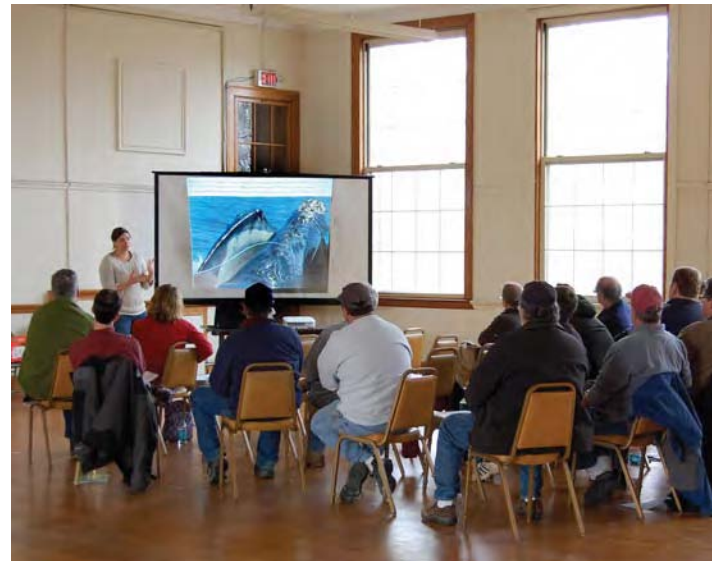
Lobstermen came forward to learn more about efforts to avoid right whale entanglement and to provide information that will help find a solution to the problem.