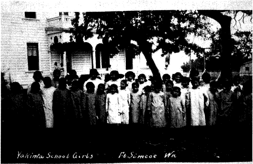
Fig. 6. Yakima School Girls, Fort Simcoe, Washington; Courtesy of Northwest Museum of Arts & Culture, Spokane, Washington.

is accorded to their more favored white sisters.” 36 The faces of the girls in the pictures below cast doubt on whether they felt the boarding school experience was lifting them out of servility and degradation.