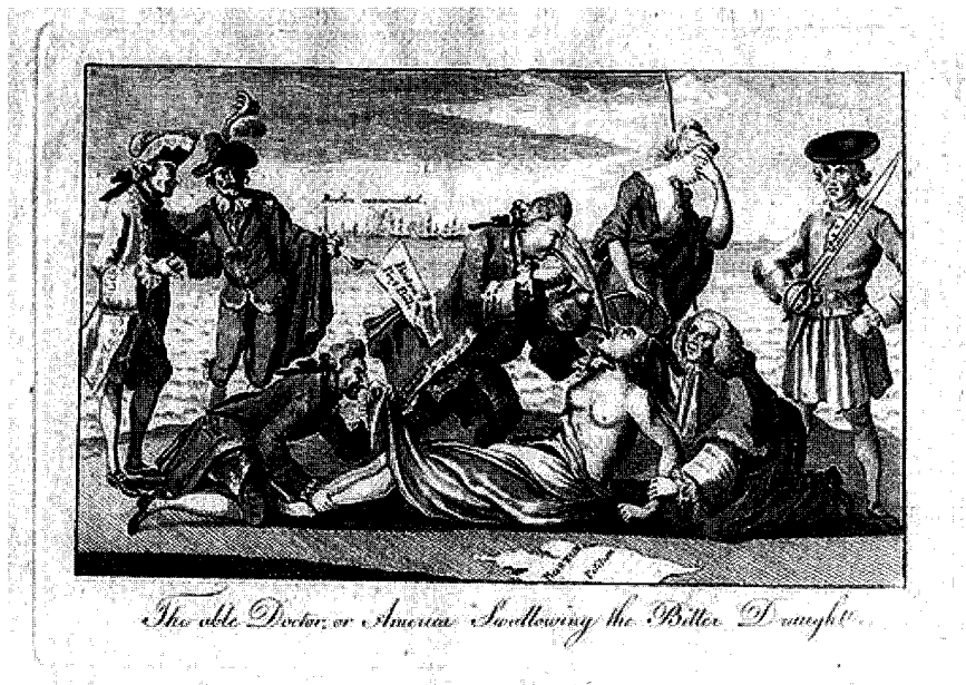
Fig. 2. Paul Revere, The Able Doctor, or America Swallowing the Bitter Draught (1774).

Once the Americans began to assert independent claims to North America, they began to see her as “their” Indian woman, needing defense against the violations of the Europeans. In 1774, on the eve of the American Revolution, Paul Revere published this cartoon of America as an Indian woman defiantly spitting tea back at the British officers seeking to look up her skirt. (Fig. 2.).