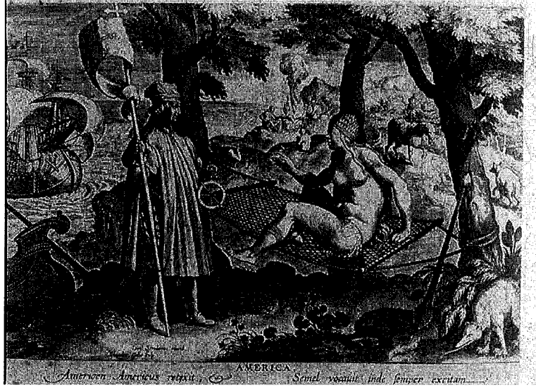
Fig. 1. Theodore Galle, Vespucci Discovering America (1580)

Once the Americans began to assert independent claims to North America, they began to see her as “their” Indian woman, needing defense against the violations of the Europeans. In 1774, on the eve of the American Revolution, Paul Revere published this cartoon of America as an Indian woman defiantly spitting tea back at the British officers seeking to look up her skirt. (Fig. 2.).