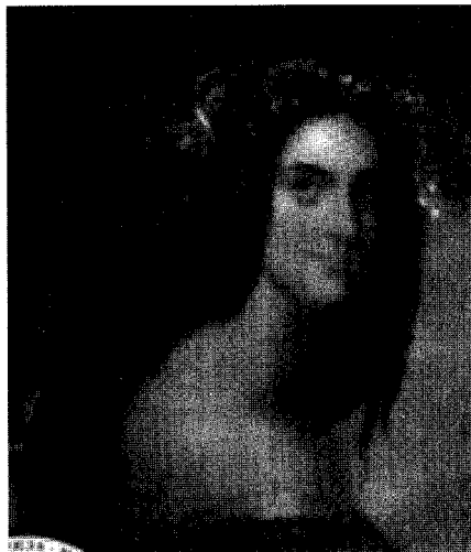
Fig. 4. Robert Matthew Sully, Pocahontas (1832)

Once seduced by the attractions of white men and their superior culture, Indian women could be saved, introduced to Christianity, and cleansed of their degrading pasts. Two pictures from the 1830s show the sexual allure and colonial opportunity presented by Indian women. Robert Matthew Sully's 1832 painting shows Pocahontas as she is often imagined, as a voluptuous temptress before her marriage. (Fig. 4.)