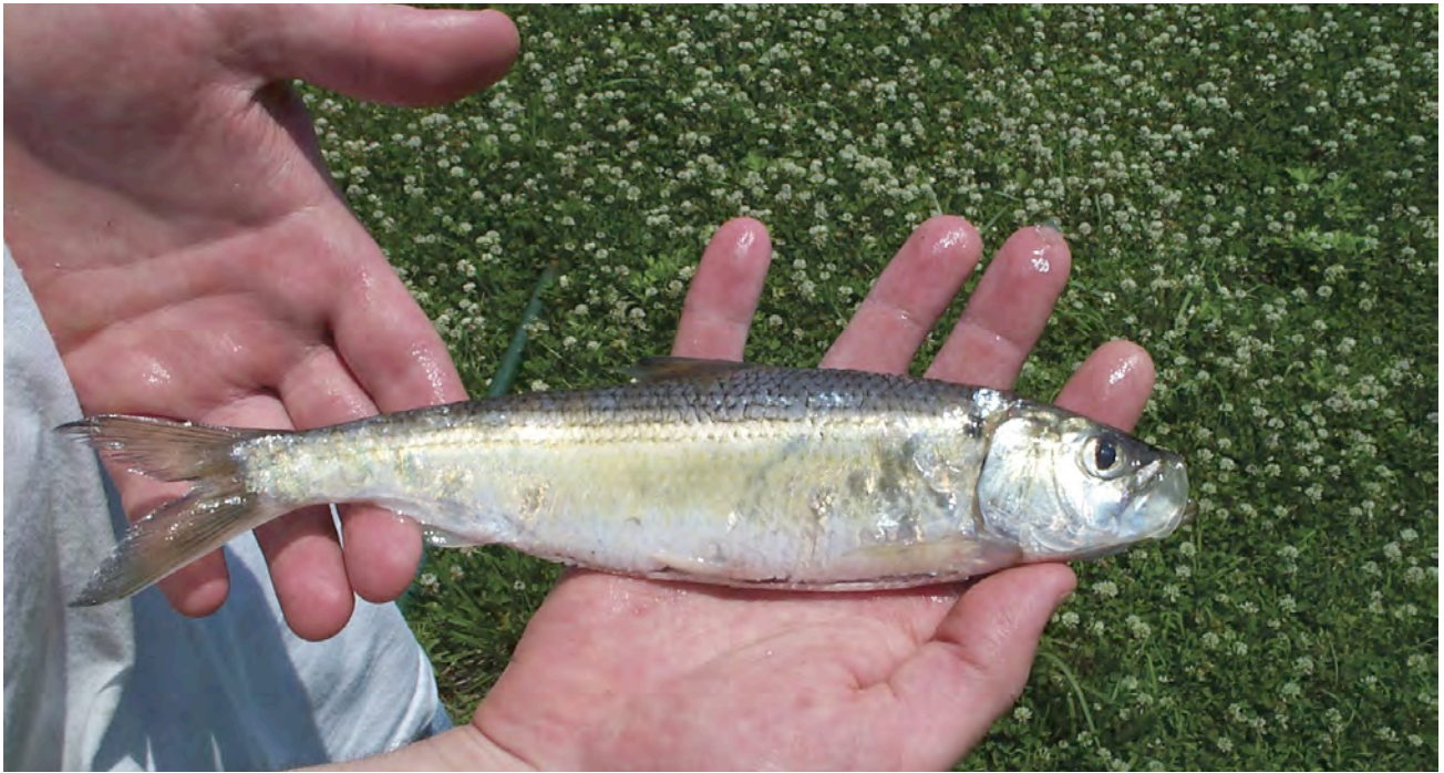
Tim Wildman, CTDEP

The blueback herring, another migratory river herring, can be difficult for the novice to tell apart from the alewife. Together, these migratory spawners are an essential food source for a very wide assortment of fish, birds, reptiles, and mammals.