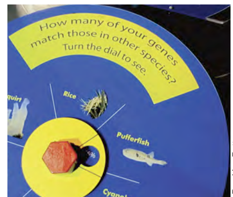
Turn the genome similarity dial to find out how genetically similar you are to other species.

Dissecting the DNA codes that make dinoflagellates unique and able to form red tides and produce toxins may someday help scientists find genetic markers that will predict when a toxic red tide is forming and its