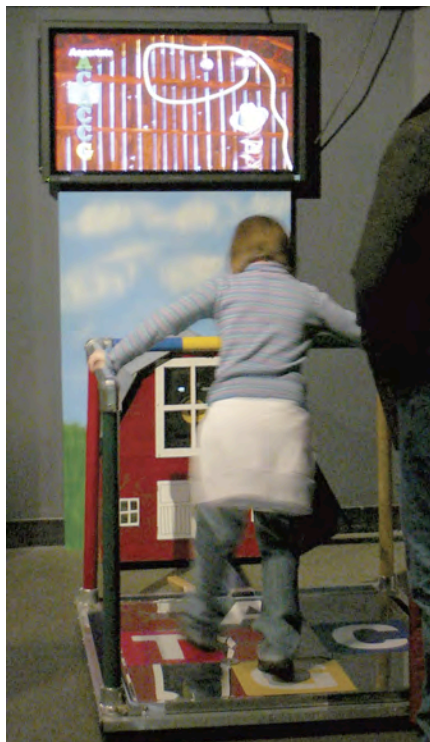
The Codon Hoedown-dancepad puts science in motion. Stepping on the right letter lets you build a virtual strand of DNA with the correct components. You have to be fast on your feet!