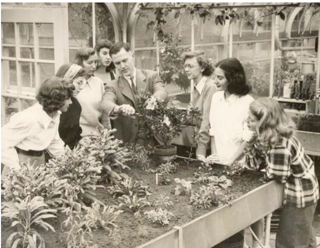
Connecticut College Arboretum