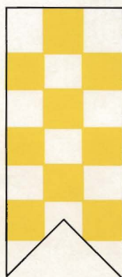
LIBERAL ARTS & SCIENCES