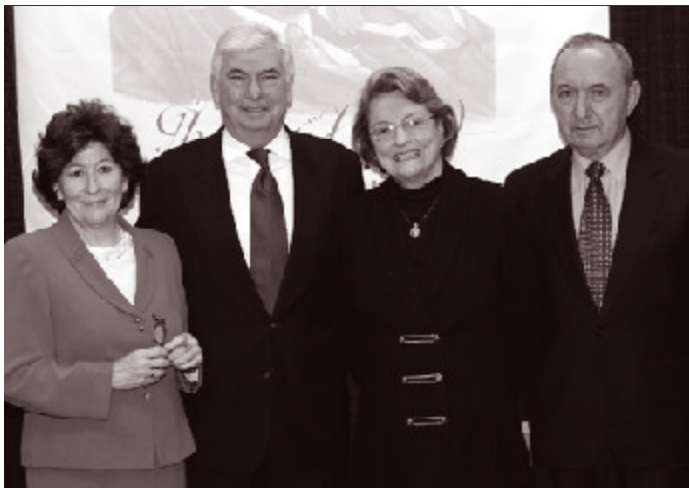
Human rights advocates Louise Arbour (left) and Richard J. Goldstone (far right), shown here with Senator Christopher Dodd and former Congresswoman Barbara Kennelly, received the 2005 Thomas J. Dodd Prize in International Justice and Human Rights in a ceremony on October 17.

Some 300 people gathered on the plaza of the Thomas J. Dodd Research Center on October 17 to honor two attorneys for their roles in advancing international justice.