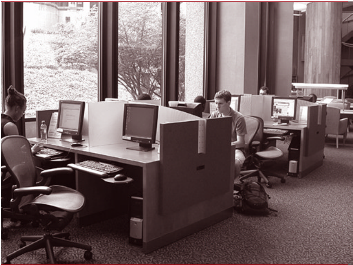
Renovated study area in the UConn Health Center Library

The two computer classrooms, previously defined with