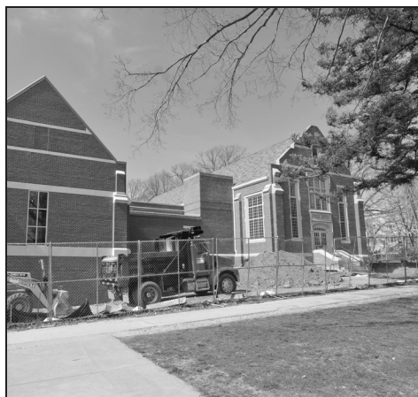
ROOF, FAÇADE AND DRAINAGE IMPROVEMENTS TO THE BENTON MUSEUM HAVE BEEN COMPLETED. THE MUSEUM, WHICH CONSISTS OF THE FORMER REFECTORY BUILDING AND A 2004 ADDITION, IS NOW UNDERGOING INTERIOR RENOVATIONS, INCLUDING THE INSTALLATION OF NEW MECHANICAL AND FIRE SUPPRESSION SYSTEMS IN THE MUSEUM AND ITS SUPPORT AREAS.

Beach Hall was constructed in 1929 and contains research labs, offices and classrooms for various schools in the College of Liberal Arts and Sciences. The four-story building has 83,500 square feet of space. A general renovation (including building systems, code/ADA and interior upgrades) of the facility is required to meet its current use. The project design phase is underway; and construction will take place over several years. A variety of code upgrades have been completed.