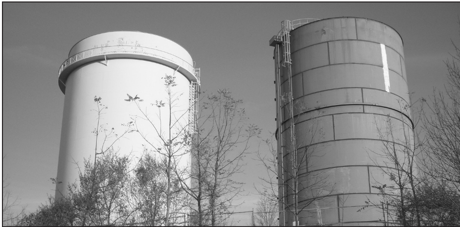
TWO AGING WATER TOWERS ON UCONN'S STORRS CAMPUS ARE BEING TAKEN DOWN AND REPLACED WITH A NEW ONE MILLION GALLON WATER TANK. THE OLDER OF THE TWO TOWERS TO BE REMOVED HELD 300,000 GALLONS AND WAS ORIGINALLY CONSTRUCTED IN 1914. THE OTHER, CONSTRUCTED IN THE 1930S, IS A 600,000-GALLON TANK AND IS TOPPED BY A ROUGHLY 80 YEAR-OLD LOOKOUT TOWER THAT WAS USED TO SPOT FIRES ON CAMPUS AND THROUGHOUT THE REGION UNTIL THE MID-1960S.

updates; however, as a result of the reallocation of bond funds, this project is now scheduled for later in the UCONN 2000 program.