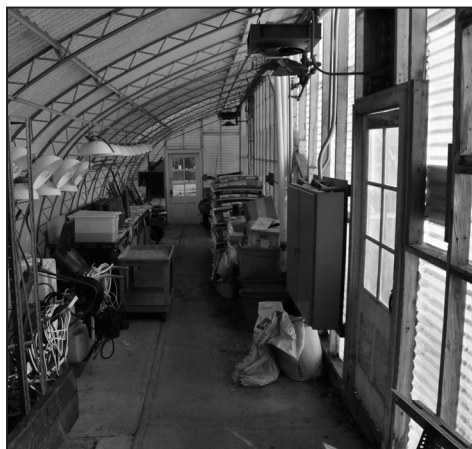
THE FLORICULTURE GREENHOUSES ADJACENT TO RTE. 195 WERE CONSTRUCTED IN 1953, AND CONTAIN 23,750 SQUARE FEET OF HEADHOUSE AND GREENHOUSE SPACE. THE HEADHOUSE HAS BOTH CLASSROOM LAB SPACE AND SUPPORT SPACE FOR THE GREENHOUSES THAT ARE IN NEED OF RENOVATION. THE CLASSROOM, FAÇADE AND ROOF NEED REPAIRS AND SOME INTERNAL WORK – IN ADDITION TO THE CLASSROOM – WILL BE COMPLETED DURING THIS PROJECT.

School of Fine Arts (SFA) facilities throughout the Storrs and Depot campuses since 1991, a revised Master Plan has assessed the condition of the current facilities, updated the program requirements of the School, and made draft recommendations to guide the use of UCONN 2000 funds at this location. The final Master Plan recommends a multi-phased approach to the expansion and renovation of the entire SFA complex. Evaluation of the needs of the existing buildings currently occupied by SFA departments and new initiatives is underway.