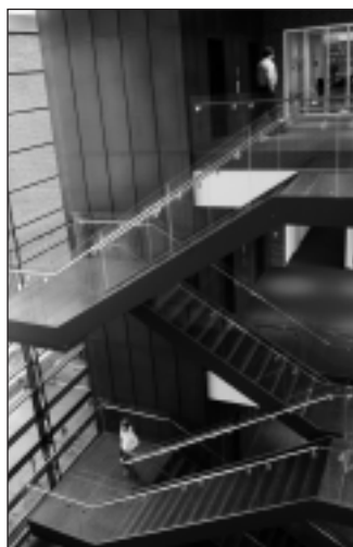
A VIEW OF THE ATRIUM OF THE PHARMACY/ BIOLOGY BUILDING FROM THE COURTYARD, (LEFT).