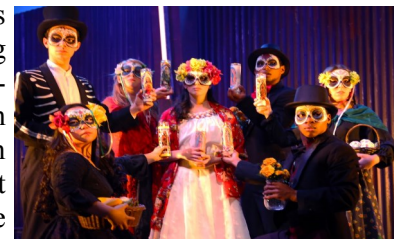
NUEVO CALIFORNIA company.

we must face our anxieties towards otherness. By exploring this "what if" panorama, different characters engage in overlapping and sometimes contested accounts of their relation to "the border". We perceive how our notions of borders, impregnated with vast political, historical and personal baggage, shape the way in which we relate to others daily. 'Nuevo California' suggests that this mediation is and should always be actively questioned. We begin by recognizing the 'other' beyond the borders to which we confine them.