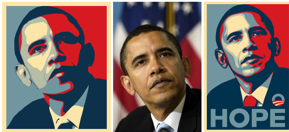
Figure 2. Barack Obama “Hope” Poster

Now, juxtapose “Take it to the Wall” with “Exit Through the Gift Shop,” a documentary that explores stenciling, stickers, and street art in the United Kingdom. Is this latter form of public art vandalism or graffiti? What makes the mural painting art, and the sorts of artwork highlighted in Thierry Guetta’s documentary “Exit Through the Gift Shop” criminal activity? Street art, as documented in the film, is clearly political, raw, unfiltered, and aggressive. Thierry, an art aficionado taped street artists in the act of doing their work. Thierry, later, himself, became a recognizable figure in the art scene after he put together an event where he sold over $1 million of his artwork. His artist name is Mister Brainwash. In fact, one well-known street artist captured and followed in this documentary is Shepard Fairey, the acclaimed artist who painted the well-known and ubiquitously famous, Barack Obama “Hope” poster used in the successful Barack Obama presidential campaign in 2008.