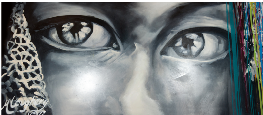
Figure 1. “Take it to the Wall” Mural Panel 5 of 7

Jasper’s introduction speaks to the heart of social justice: local youths speaking truth to power despite societal hierarchies.