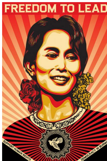
Figure 3. “Freedom to Lead” Sticker

Further evidence that Fairey is a human rights activist and advocate can be seen in artwork that he has produced ( www.obeygiant.com ). For instance, I was given a sticker (see Figure 3) of Aung San Suu Kyi that he produced for the U.S. Campaign for Burma ( www.uscampaignforburma.org ) by one of my undergraduate students. The sticker has an image of Suu Kyi, above which says “Freedom to Lead” and below which says “Support Human Rights” and “Democracy in Burma.” To better understand the aim of this work, the U.S. Campaign for Burma (USCB) is a U.S. based membership organization dedicated to empowering grassroots activists around the world to rally for human rights and to bring an end to the military dictatorship in Burma.