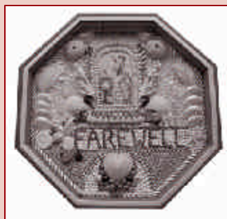
Gallery on the Plaza