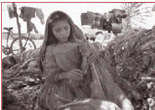
A Huichol girl threads tobacco strings in the tobacco fields of Nayarit, Mexico, 2001.

Reports of Nazi atrocities; photographs of bonded child laborers; case files of refugees seeking asylum in the United States; firsthand accounts of prison life in apartheid South Africa. These are just a few of the human rights collections housed in the Thomas J. Dodd Research Center at the University of Connecticut Libraries, one of only a handful of archival repositories in the United States focusing on human rights materials. Human rights collections cover a wide array of materials and formats, and often contain sensitive materials. They may detail personal traumas or provide a voice to marginalized groups whose rights have not been protected. Other documents are records created by abusive regimes and individuals. Others showcase the work of activists and human rights practitioners in their struggles for justice. Still other collections provide a record of transitional justice and reconciliation efforts. Human rights archival collections have a variety of uses, including academic research, teaching and instruction, as well as advocacy, bringing perpetrators to