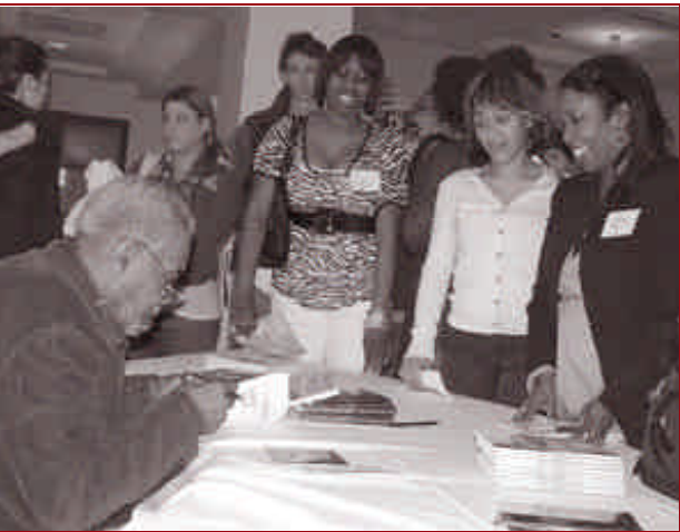
Poet, playwright, and activist Amiri Baraka signs books after his talk.

Today the IAAS functions with a director, an associate director, an administrative assistant, a faculty advisory board, a teaching fellow, 10 joint-appointed faculty, and three student assistants.