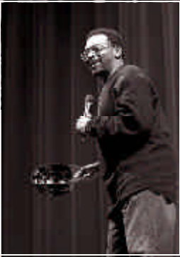
Award-winning filmmaker Spike Lee was the keynote speaker.

In celebration of Black History Month in February, the UConn Libraries featured related library and archival resources including books, films, research guides, and Web sites: http://www.lib.uconn.edu/using/Diversity/Black_History.htm