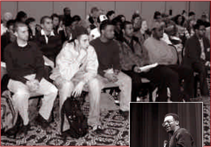
Audience members listen to a panel discussion at the Harlem Renaissance conference.

In celebration of Black History Month in February, the UConn Libraries featured related library and archival resources including books, films, research guides, and Web sites: http://www.lib.uconn.edu/using/Diversity/Black_History.htm