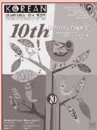
Dodd Research Center Gallery

Cultural Maintenance & Assimilation Roles