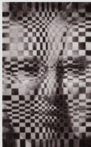
Gallery on the Plaza