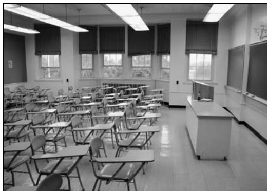
CONSTRUCTED IN 1929, BEACH HALL HOUSES RESEARCH LABORATORIES, OFFICES AND CLASSROOMS FOR THE COLLEGE OF LIBERAL ARTS AND SCIENCES. THIS 83,500 SQ FT BUILDING WILL UNDERGO GENERAL RENOVATION, INCLUDING ADDING HIGH TECHNOLOGY CLASSROOMS, MAKING THE BUILDING COMPLIANT WITH AMERICANS WITH DISABILITIES ACT AND OTHER INTERIOR UPGRADES.

During the UCONN 2000 program the needs for research space were addressed with the new Marine Sciences building, as well as construction of a new facility for Project Oceanology. With the repairs to the Branford House, the needs for administrative space were met when new infrastructure was installed. However, the remaining significant need is for undergraduate program space, currently housed in the WWII era former Coast Guard facilities. This project will support new or renovated undergraduate instructional and library space.