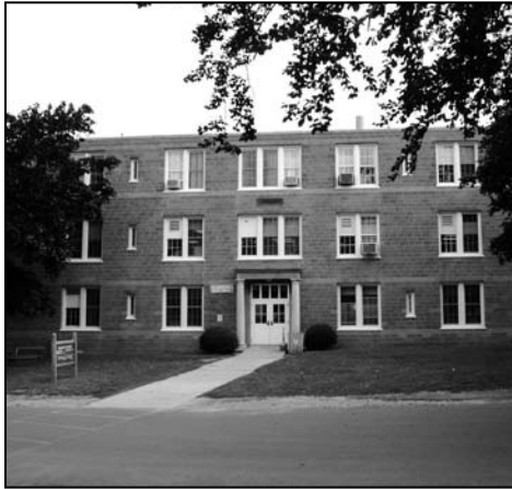
UPGRADES AT THE AVERY POINT CAMPUS HAVE INCLUDED RENOVATION OF CLASSROOMS AND LABORATORIES IN THE ACADEMIC BUILDING, AS WELL AS UPGRADES TO THE UNDERGROUND STEAM DISTRIBUTION SYSTEM, POOL AND GYM.