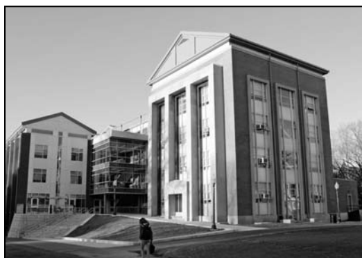
ON THE LEFT, WORK ON THE GENTRY BUILDING, WHICH HOUSES THE NEAG SCHOOL OF EDUCATION, INCLUDED AN ADDITION TO THE BUILDING. THE NEXT PHASE WILL INCLUDE RENOVATION OF THE OLD BUILDING.

The enhancement of the University’s infrastructure includes its instructional and scientific equipment. The equipment replacement category permits the University to replace outmoded items with state of the art laboratory devices and computers. The funding covers seven major categories: management information systems, computers, research equipment, instructional equipment, furnishings, operational and public safety support, and library materials. The total twelve-year project line now tallies $155.3 million.