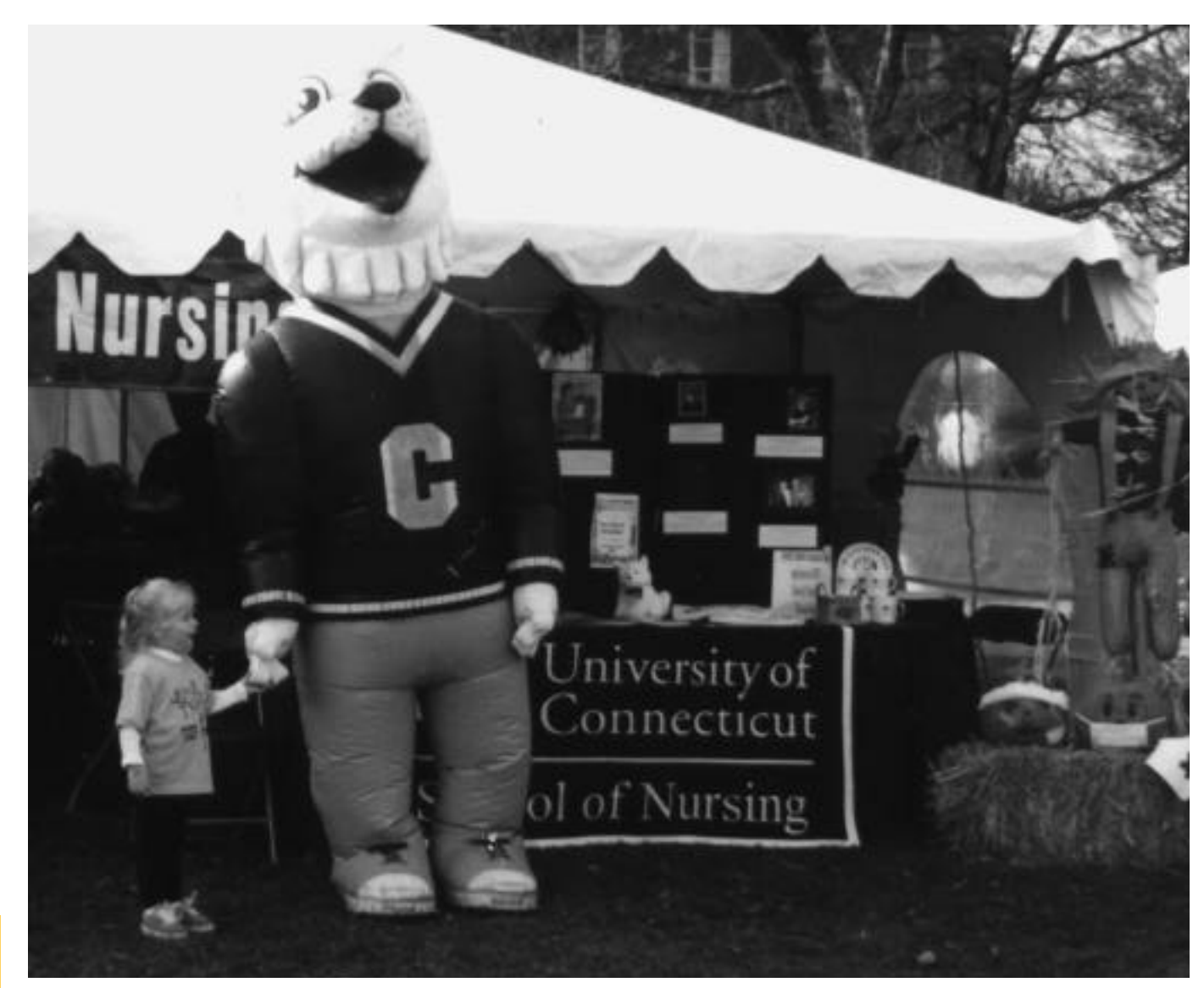
Big Blue visits the tent as alums, families, and friends eat lunch.