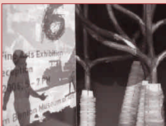
Detail: MFA exhibition announcement

Student Work in Communication Design At the University of Connecticut