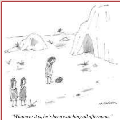
"Whatever it is, he's been watching all afternoon."