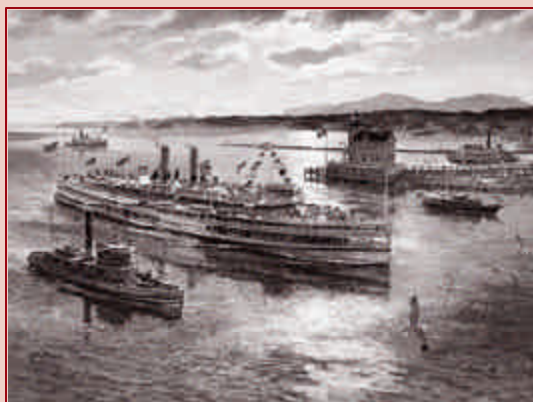
The Alexander Hamilton