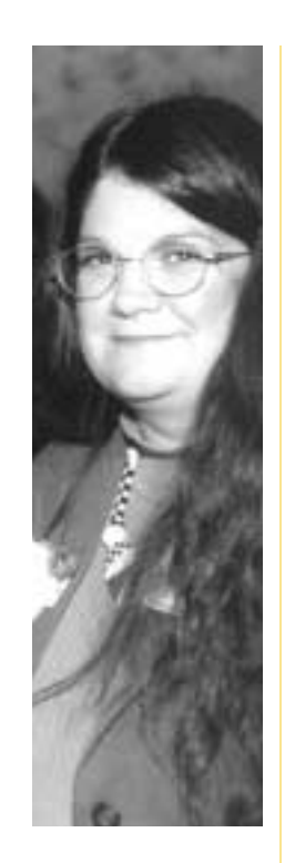
"We continue to look for volunteers..."

am enjoying making many new friends and getting to know some great UConn nurses as the new president and the "Alumni Connection" to the School of Nursing. We share a wealth of knowledge and varying nursing experiences on the alumni board. One of the perks of the job is attending Homecoming. Before this full day begins, we hold a very productive General Membership Meeting. The Alumni Association, Schools and Colleges, and affinity groups always do a superb job hosting visitors. The abundance of UConn fans, food, and free giveaways is wonderful. Typically, the School of Nursing hosts over 100 visitors. In 2000, the class of '80 took the prize for the most social group. Most alumni returning to campus are amazed at the ongoing improvements and construction projects. To culminate the celebration, the SON holds the Annual Alumni Awards Banquet on the Saturday evening of Homecoming weekend. Being with the UConn nurses from all parts of the USA honored for their phenomenal contributions to nursing makes me proud to be an alum.