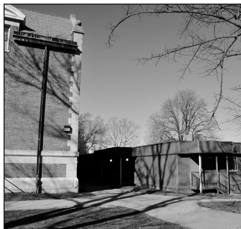
RESIDENTS OF STORRS HALL, PART OF UCONN'S "OLD CAMPUS," HAVE BEEN USING A MODULAR BUILDING PLACED IN FRONT OF THE ORIGINAL STRUCTURE FOR MORE THAN A DECADE. DESIGN WORK HAS NOW BEGUN ON AN ADDITION TO THE BUILDING, WHICH IS EXPECTED TO ALLEVIATE THE SPACE CRUNCH AND ALLOW THE UNIVERSITY TO REMOVE THE MODULAR.

Although the quantity and the diversity of campus living arrangements were expanded under the first two phases of UCONN 2000, much remains to be done. Some renovations of the older dormitories, with code improvements and sprinkler installations, were accomplished. However, a number of the older facilities still await renovation and the West Campus and Graduate Dormitory complexes have remained essentially untouched (except for sprinkler/safety improvements) pending a final residential facility plan. This project provides funds for renovation and construction activity as deemed appropriate by the Board of Trustees. Multiple projects are underway or completed for the installation of sprinkler systems, replacement of elevators, windows and roofs in various residential facilities.