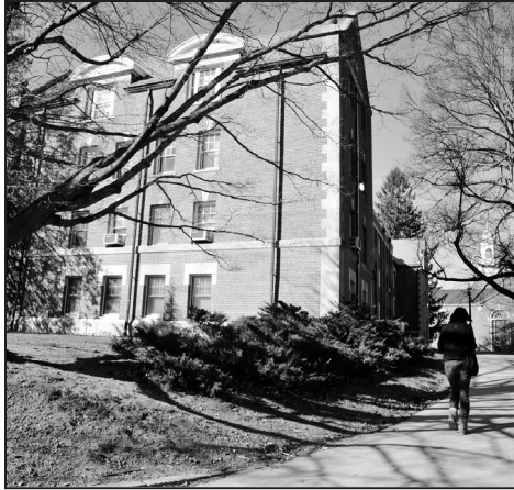
KOONS HALL, ONE OF THE OLDEST BUILDINGS ON CAMPUS (1915), IS IN LINE FOR FAÇADE REPAIR, WINDOW REPLACEMENT, AND MECHANICAL WORK. THE STRUCTURE, HOME TO UCONN'S DEPARTMENT OF ALLIED HEALTH, OFFERS FIVE FLOORS OF LABS, OFFICES AND CLASSROOMS.