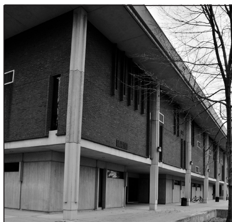
THREE BUILDINGS AT UCONN'S WEST HARTFORD CAMPUS, WHICH SERVE THOUSANDS OF STUDENTS ANNUALLY, ARE SCHEDULED FOR THEIR FIRST EXTENSIVE RENOVATION SINCE THEIR CONSTRUCTION IN THE LATE 1960S AND EARLY 1970S. THE BUILDINGS — A CLASSROOM BUILDING, A LIBRARY AND THE SCHOOL OF SOCIAL WORK — REQUIRE 21ST CENTURY UPGRADES AND FUNCTIONAL RENOVATIONS, INCLUDING NEW ROOFS. WORK IS SCHEDULED TO BE PHASED IN OVER SEVERAL YEARS.

As enrollment increases at the Waterbury campus, changes will be needed to meet new enrollment levels and program needs. The project would permit these modifications, as well as more immediate needs. The courtyard is presently being enhanced, and the roof/AC enclosure requires minor improvement. As a result of the reallocation of bond funds, further planning for this project is currently on hold.