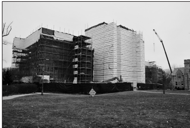
WORK CONTINUES TO REPLACE THE FAÇADE OF THE UCONN LAW SCHOOL LIBRARY IN HARTFORD. THE PROJECT, NECESSITATED WHEN THE ORIGINAL FAÇADE WORK, SUPERVISED BY THE STATE DEPARTMENT OF PUBLIC WORKS, PROVED TO BE DEEPLY FLAWED, IS EXPECTED TO BE COMPLETED THIS YEAR.

The project is currently in the design phase.