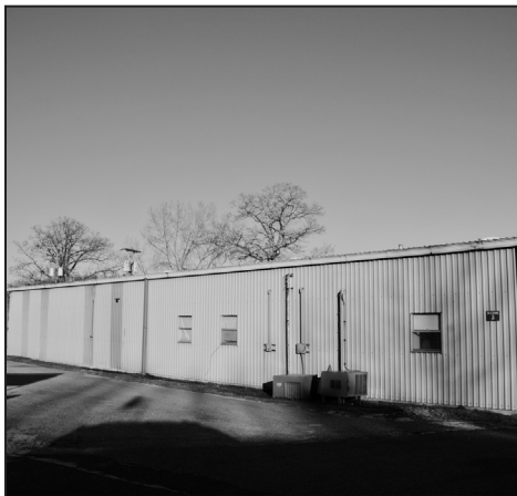
THE BIOBEHAVIORAL SCIENCES COMPLEX OFF HORSEBARN HILL ROAD, A COLLECTION OF PREFABRICATED METAL BUILDINGS MORE THAN 40 YEARS OLD AND A 14-YEAR-OLD ANNEX, HOUSE IMPORTANT RESEARCH LABS AND OFFICES. PLANS ARE UNDERWAY TO RENOVATE PORTIONS OF THE COMPLEX TO BETTER ACCOMMODATE THE ACADEMIC AND ADMINISTRATIVE FUNCTIONS.

The Museum, which consists of the former refectory building and a 2004 addition, requires repairs to the roof and façade as well as drainage improvements. The project is currently in design, and construction is scheduled to begin in the summer of 2009.