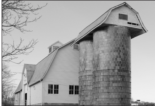
THE HISTORIC YELLOW BARN ADJACENT TO ROUTE 195 IS AMONG A NUMBER OF AGRICULTURAL BUILDINGS ON CAMPUS UNDERGOING REPAIRS AND RENOVATIONS TO ENHANCE THE FARM OPERATIONS.