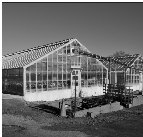
THE FLOWERS THEY CULTIVATE AND SELL ARE THINGS OF BEAUTY, BUT THE FLORICULTURE GREENHOUSE ITSELF LEAVES MUCH TO BE DESIRED. CONSTRUCTED IN 1953, THE STRUCTURE, ON ROUTE 195 JUST BELOW THE TOWERS RESIDENCE HALLS, IS IN NEED OF REPLACEMENT GREENHOUSES AND MECHANICALS, WHILE RENOVATIONS ARE NEEDED IN THE CLASSROOM AND OFFICES LOCATED IN THE BUILDING.

Numerous planning and design efforts since 1991 have evaluated the needs of the School of Fine Arts. In light of the changes in these programs, the Storrs Center initiative, and the dispersal of the School of Fine Arts facilities throughout the Storrs and Depot campuses since 1991, a revised Master Plan has assessed the condition of the current facilities, updated the program requirements of the School, and made draft recommendations to guide the use of UCONN 2000 funds at this location. The final Master Plan document will be submitted this fall.