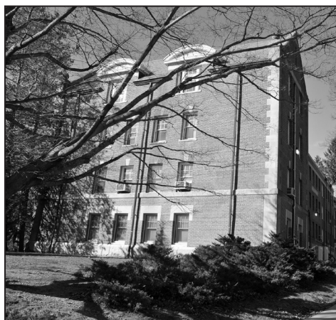
KOONS HALL, ONE OF THE OLDEST BUILDINGS ON CAMPUS (1915), IS IN LINE FOR FAÇADE REPAIR, WINDOW REPLACEMENT, AND MECHANICAL WORK. THE STRUCTURE, HOME TO UCONN'S DEPARTMENT OF ALLIED HEALTH, OFFERS FIVE FLOORS OF LABS, OFFICES AND CLASSROOMS.

The Jorgensen Center for the Performing Arts was constructed in 1956 for orchestra performances. Over the years, it has been modified to accommodate events and gatherings ranging from student functions to theater performances. The building contains five levels, including mezzanine levels above the basement and first floor. With a total of 76,408 square feet of space, the lower floor houses the Little Theatre, the Jorgensen Gallery, and a television studio. The upper floors contain a 2,600-seat auditorium, lobby areas, and support facilities. One of the shortcomings of the building is the lack of a fly loft. This project will evaluate the need for such capacity. Also included in the project are life safety, mechanical and electrical systems improvements, ADA modifications, and perimeter drainage repairs. Construction has begun on the life safety improvements (including a new fire alarm) and will be complete in spring 2010.