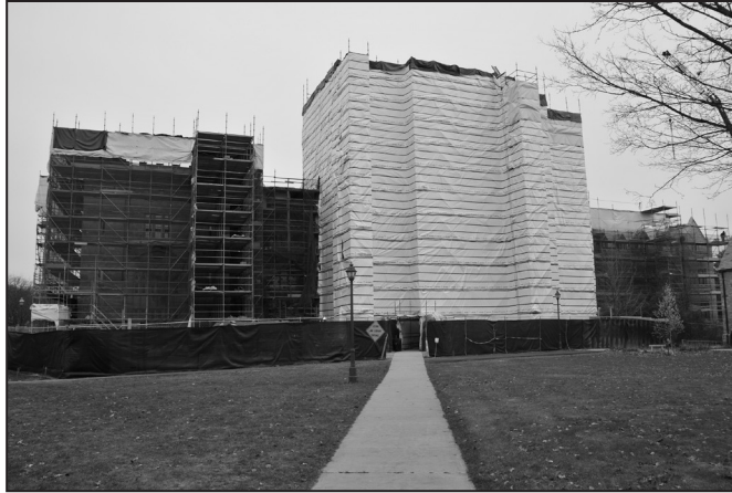
WORK CONTINUES TO REPLACE THE FAÇADE OF THE UCONN LAW SCHOOL LIBRARY IN HARTFORD. THE PROJECT, NECESSITATED WHEN THE ORIGINAL FAÇADE WORK, SUPERVISED BY THE STATE DEPARTMENT OF PUBLIC WORKS, PROVED TO BE DEEPLY FLAWED, IS EXPECTED TO BE COMPLETED THIS YEAR.