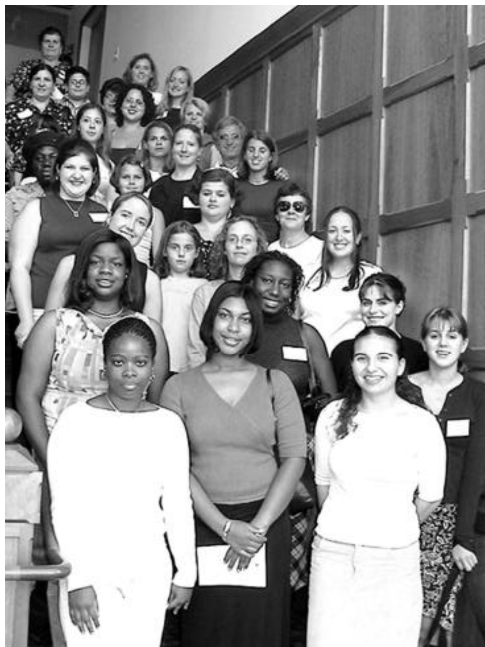
Select scholarship recipients and their families

W e are pleased to offer a wonderful array of scholarships to attract more of the best and brightest aspiring nurses to our School.