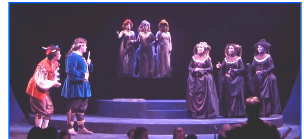
Mozart's Magic Flute , UConn Opera 2006