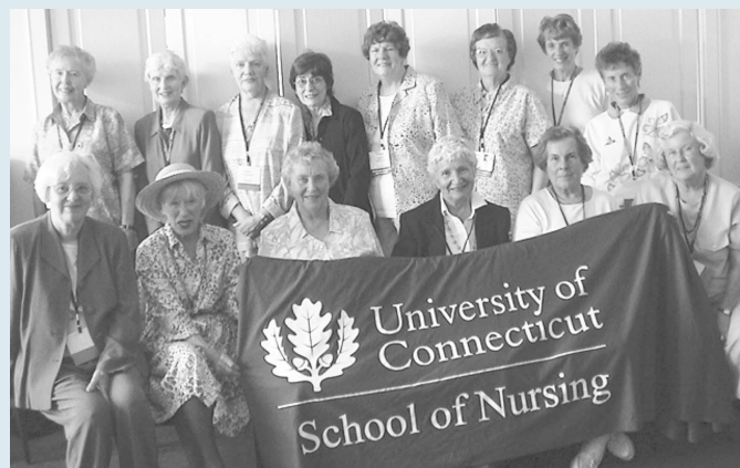
Class of '52 Reunion - School of Nursing Gathering - May 31, 2002

Oklahoma City, OK mimirnok@msn.com After 12 years staying home with my four children, I went back to work PT in labor and delivery for several years. I then worked at Presbyterian Hospital in OB-GYN for 10 years followed by 10 years at Baptist Medical center in L&D, postpartum, GYN. What a world of difference in labor techniques and monitoring in the last 25 years-to say nothing of when we went thru OB. Due to a lot of arthritis (needed two knee replacements) & sciatica I don't get around very well, but a friend of mine and I took a two-week cruise to Alaska and what a fabulous experience! I have 12 grandchildren with whom I visit and go on trips.