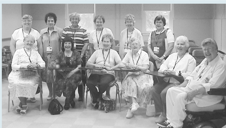
School of Nursing Class of 1953 Reunion June 27, 2003

Received a MSN from Hunter College CUNY '81. Currently working part time as Learning Resources Facilitator at Capitol Health Systems in School of Nursing. I have been an instructor at the School since the early '70s, but recently went to