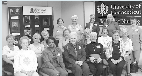
Class of '57 Celebration of 45 th Reunion, October 2002

Fountain Hills AZ susanjoslin@yahoo Enjoying retirement in AZ - most of children & grandchildren are here. Retired from position as